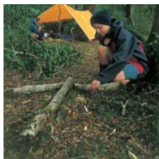
Leave signs of your whereabouts